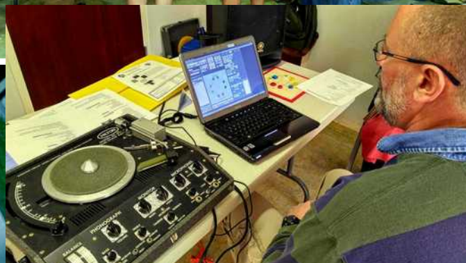
Photos from the initial workshop on March 25 th